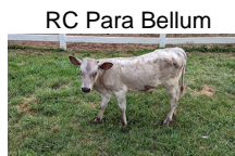
RC Para Bellum